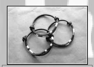
A friendship bracelet is a bracelet given by one person (friend) to another as a symbol of friendship.

Friendship Day celebrations occur on different dates in different countries. The first World Friendship Day was proposed for 30 July 1958. On 27 April 2011, the general Assembly of the United Nations declared 30 July as official International Friendship Day. However, some countries, including India, celebrate Friendship Day on the first Sunday of August.